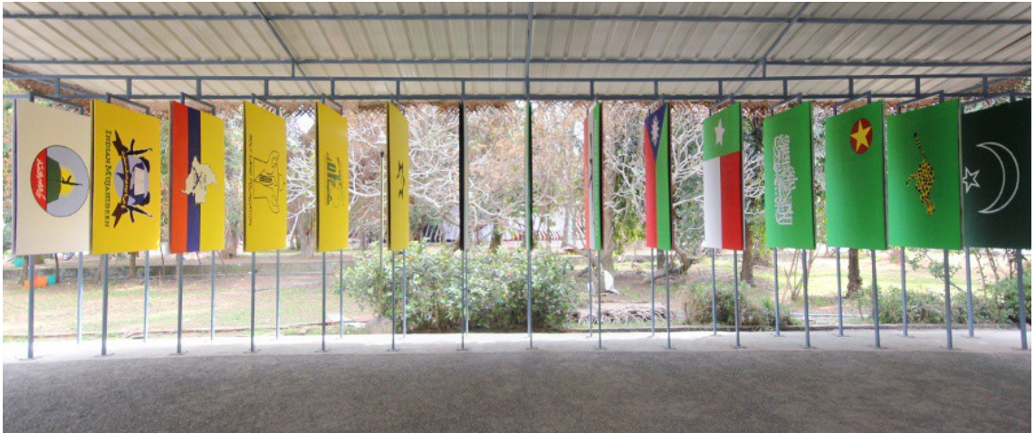
New World Summit – Kochi, 2013. Detail from the parliament of the 3rd New World Summit in Kochi, India, built as an extension of a former British colonial complex, showcasing panels with flags of organizations dealing with international blacklisting organized by color.

first summit, for instance, and the maps representing unrepresented states made for the fourth.