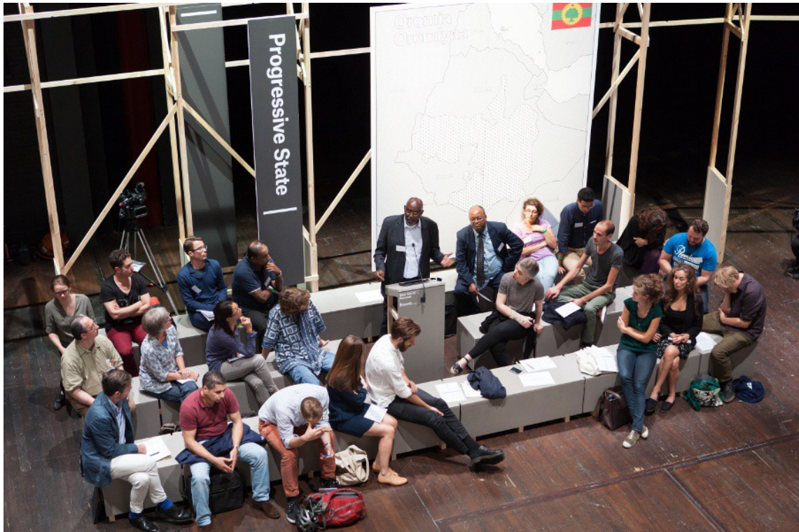
Abdirahman Mahdi, representative of the Ogaden National Liberation Front, speaks on behalf of the Oromo Liberation Front (OLF) in his lecture "A Criminal State: The Blacklisting of the Oromo Liberation Struggle for Freedom and Democracy."

framework? What is it that we can learn from these specific discourses? These questions responded to our own condition living in states creating its own states of exception, abandoning the rule of law. So what can we learn from those who have been placed outside of such a condition, and what is our indebtedness to these specific groups? This is actually how we got to know about the Kurdish Women's Movement in particular. We soon realised that the New World Summit should not be understood as a project, but rather as an endeavour with a much longer lifespan.