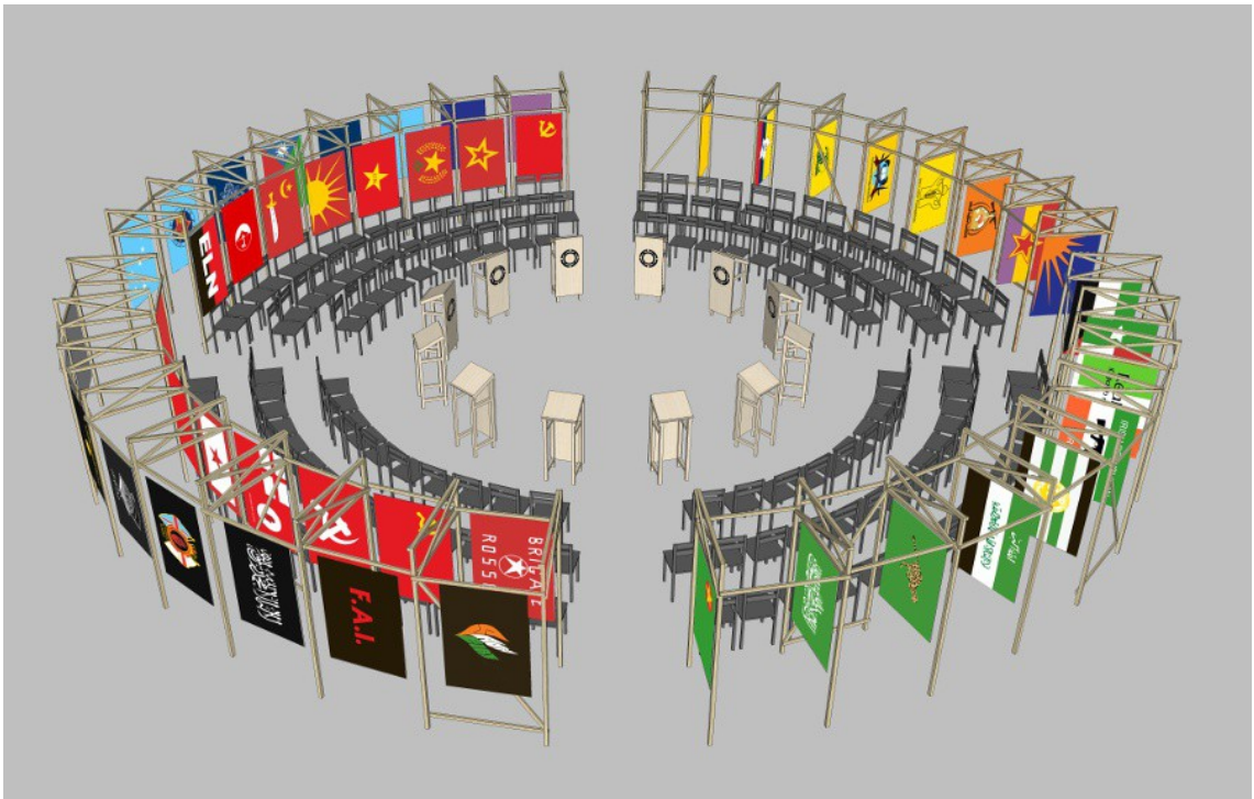
New World Summit – Berlin, 2012. Image: In collaboration with Paul Kuipers (Event-Architecture). Design of the parliament of the 1st New World Summit, surrounded by flags of organizations currently dealing with terrorist blacklisting, organized by color