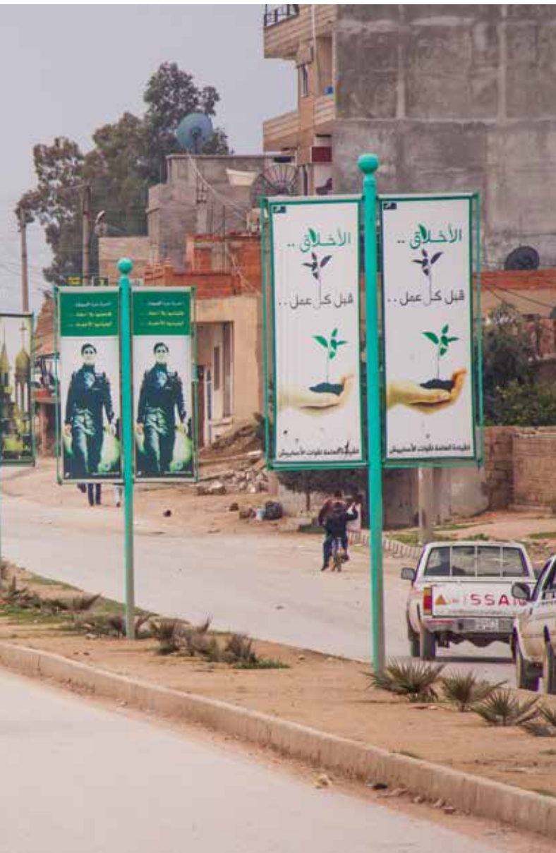
Posters of the Women's Defense Units (YPJ) on the streets of Qamishiilo.