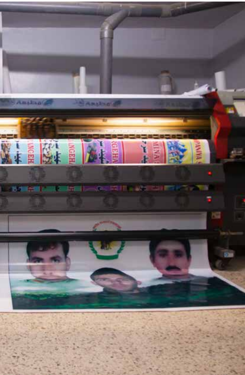
Printing house Algad in Qamişlo produces images of recently martyred members of the autonomous regions of Rojava.