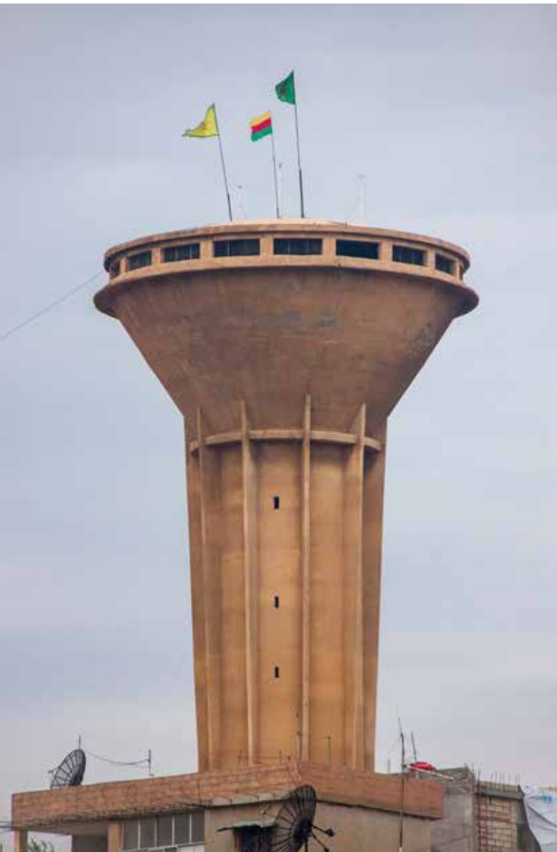
A water tower in Qamişlo is covered with the flags of the Rojava Revolution, the People's Defense Units (YPG) and Women's Defense Units (YPJ).