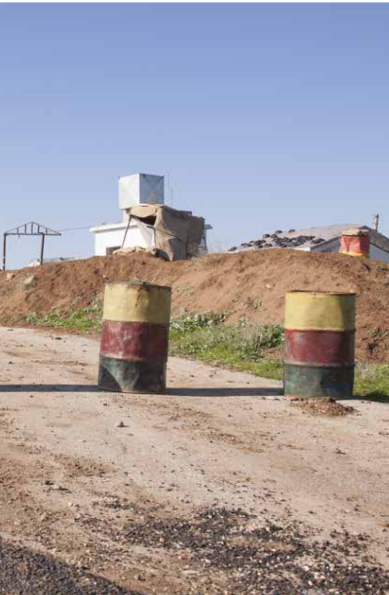
Entrance to a training camp of the autonomous people's armies of Rojava, the People's Defense Units (YPG) and Women's Defense Units (YPJ), near the border between Southern Kurdistan (Iraq) and the autonomous canton of Cizire in Western Kurdistan (Syria).