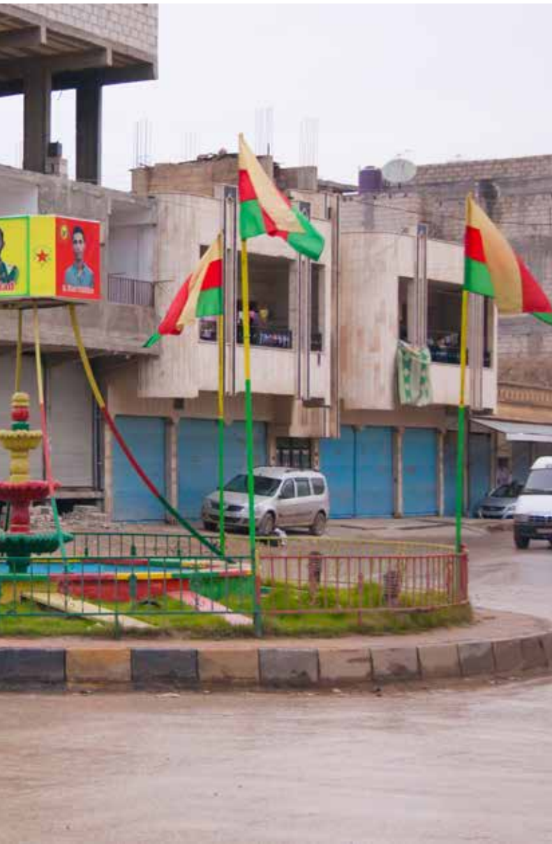
An old fountain of the Assad regime in Qamişlo has been turned into a monument of the Rojava Revolution, painted yellow, red, green—the colors of the flag of the Democratic Union Party (PYD)—and carrying several martyr portraits of deceased revolutionaries from its defense units.