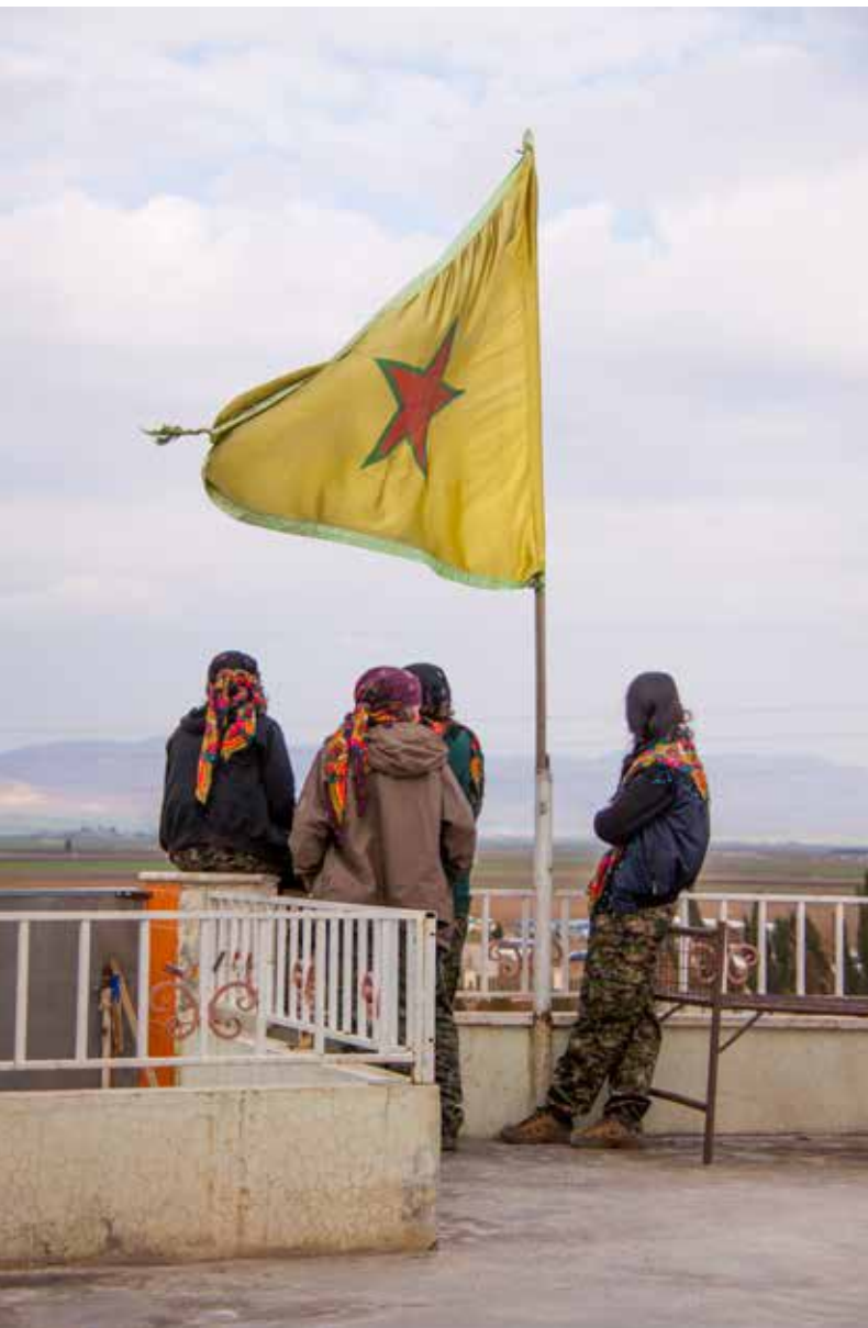
Special forces of the Women's Defense Units (YPJ) look out over their training camp situated near Qamişlo.