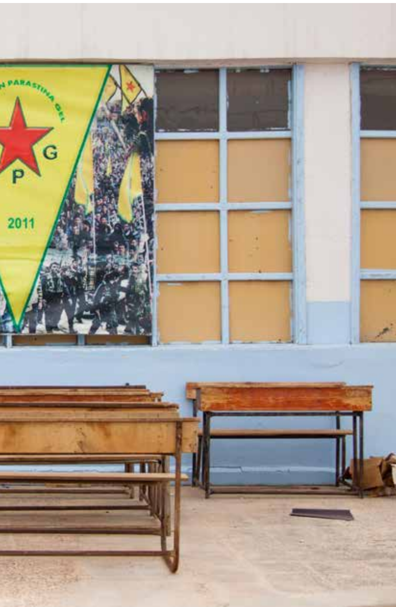
Classroom for ideological education of the People's Defense Units (YPG).