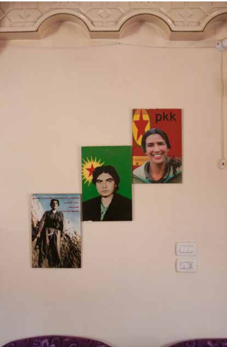
Portraits of women revolutionaries in the House of Women (Mala Jin) in Qamişlo. The House of Women provides social and juridical support, conflict mediation, and protection to women from the region facing (domestic) violence or discrimination.