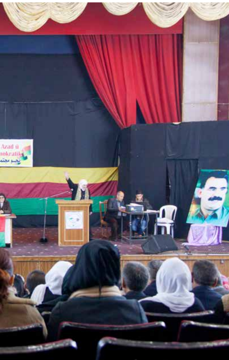
Members from neighborhood councils and cooperatives present themselves as candidates for the position of Co-Chair of the People's Council of the city of Qamişlo. The slogan on stage, Her Tist Jibo Jiyaneke Azad û Avakirina Civakê Demokratîk , translates to "Everything for a Free Life and the Foundation of a Democratic Society." On the right is a portrait of the founder of the Kurdistan Workers' Party (PKK), Abdullah Öcalan.