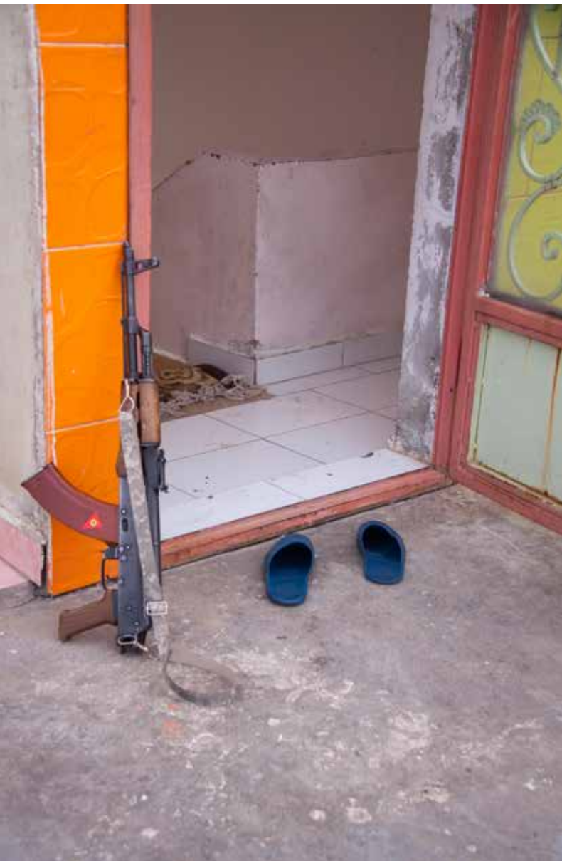
Living quarters of the training camp of the Women's Defense Units (YPJ), situated near Qamişlo.