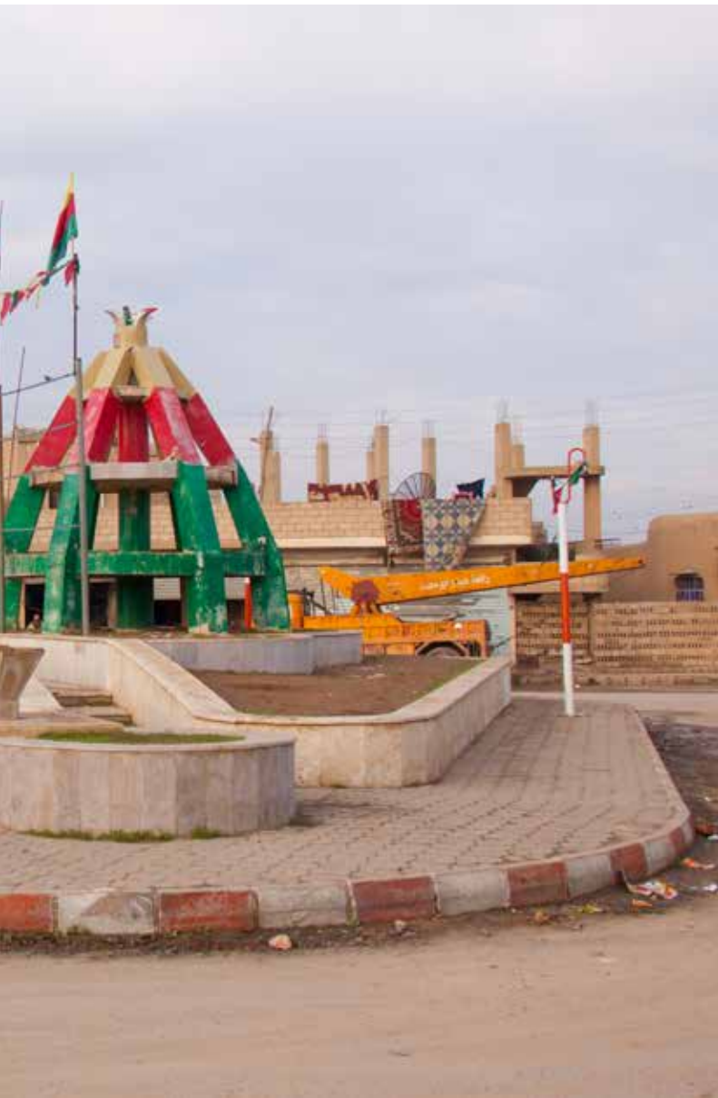
A sculpture of the Assad regime in Dirbésiyé has been repainted in yellow, red, green—the colors of the flag of the Democratic Union Party (PYD)—and thus declared a monument for the Rojava Revolution.