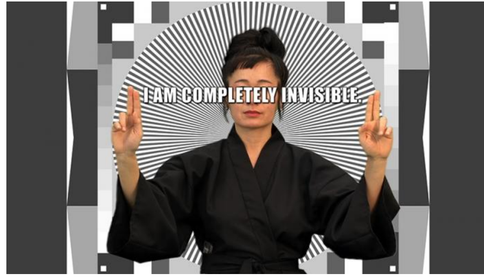
Hito Steyerl, How Not To Be Seen: A Fucking Didactic Educational .MOV File, 2013, HD video, colour, sound, 14min, stills.