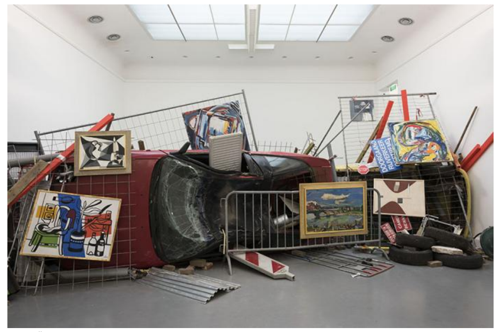
Ahmet Öğüt, Bakunin's Barricade, 2014, mixed-media installation, including paintings by Marlene Dumas, El Lissitzky and Pablo Picasso. Installation view, 'Ahmet Öğüt: Forward!', Van Abbemuseum, Eindhoven, 2015.

revolutionaries undermine one institution after another from within.<sup>10</sup> As the revolutionary impetus of the late 1960s petered out, sociological accounts of practice as immanent to fields and institutions became dominant, and the concept of habitus became a mediator in the dialectic of practice and institution.<sup>11</sup> In institutional critique, avant-garde transgression was replaced by an equally problematic fetishisation of immanence, of critical loyalty to the institution.