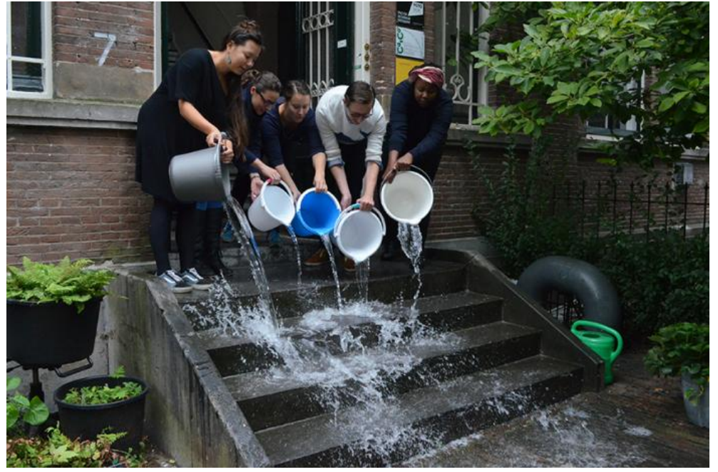
Common cleaning exercise as part of 'Site for Unlearning (Art Organization)', a project by Annette Krauss and Casco staff, 2014—ongoing.

themselves be pursuing an alter-institutional practice. Still, in entering into alliances with art institutions, they run the risk of relapsing into a purely strategic and pragmatic approach to the frameworks in which they operate.