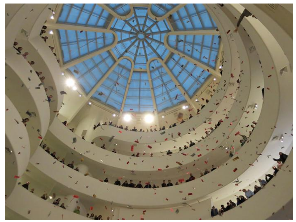
Gulf Labor / Global Ultra Luxury Faction (G.U.L.F.) action at the Guggenheim Museum, New York, 29 March 2014.