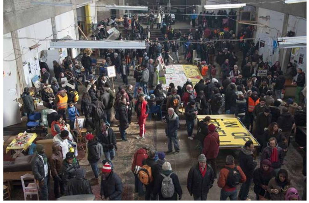
The refugee collective We Are Here in 'The Church of Refugees', a squatted church in Amsterdam, 2012.

co-individuation is essential if education is to be emancipatory — an education that could lay claim to being an aesthetic education in the most profound sense. When the participants are homeless or 'illegal', spending a few hours in a safe and warm space obviously becomes all the more important.