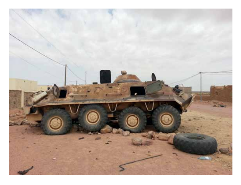
An armed vehicle of the Malian army was destroyed 17 May 2014 in Kidal by the forces of the MNLA.