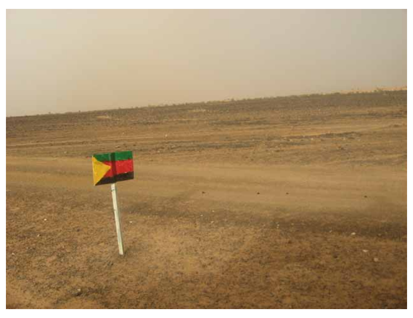
Indication of the borders of Azawad in the middle of the desert.