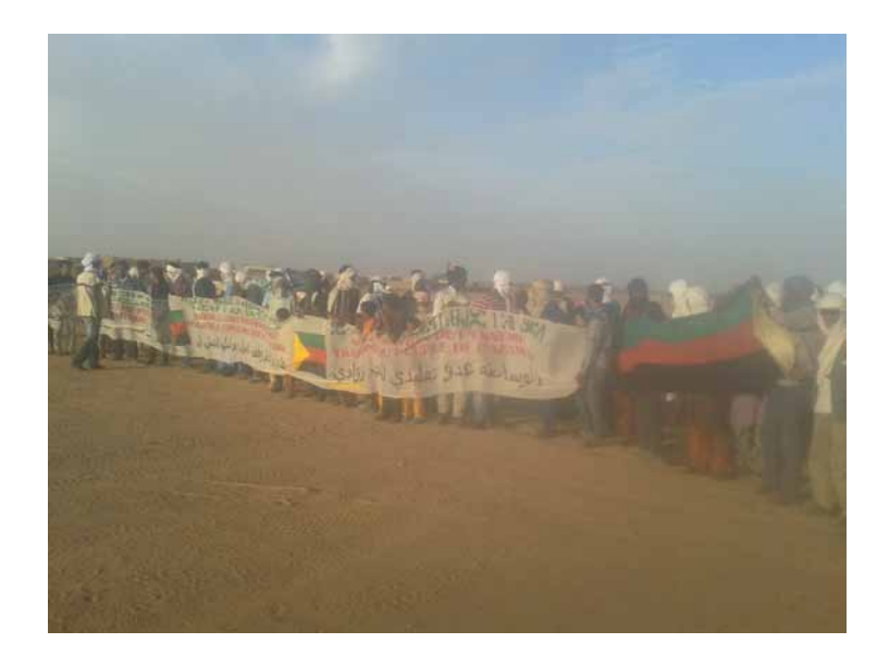
Demonstrators, mainly women and youth, opposing the presence of the Malian army in Kidal on 2 May 2014.