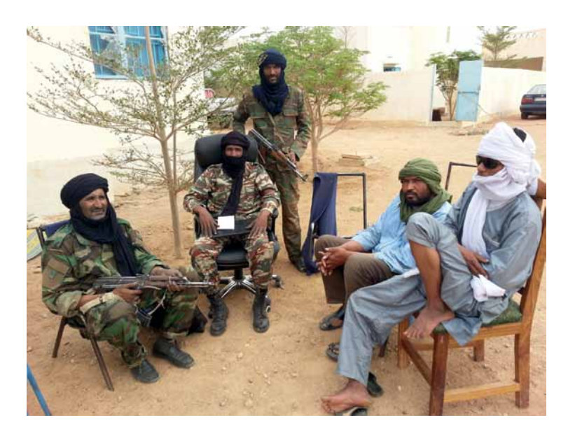
Fighters of the MNLA in the courtyard of their headquarters at Kidal. Their clothing is standard military arsenal, while their traditional headscarves—the tagelmust—remains on, protecting them from wind, sand, and thirst.